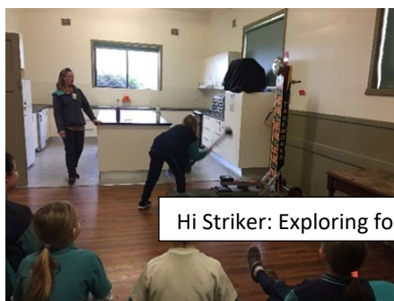
Hi Striker: Exploring forces