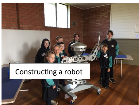
Constructing a robot

Our science incursion has been re-scheduled for the 30 th of August. This incursion is totally hands-on and the equipment is designed in alignment with teaching STEM as well as general physical sciences. The Taskworks Company visited our school in 2019 and the students still talk about all the fantastic activities they were able to do.