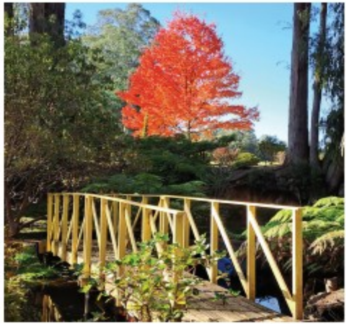
Tall Timbers, Piedmont