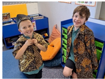
Performing in costumes.