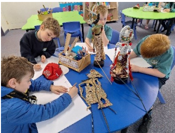
Writing scripts for shows.