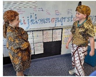
Performing in costumes.