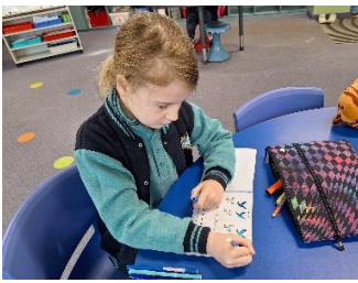
Making animal counting books.