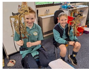
Performing puppet shows.